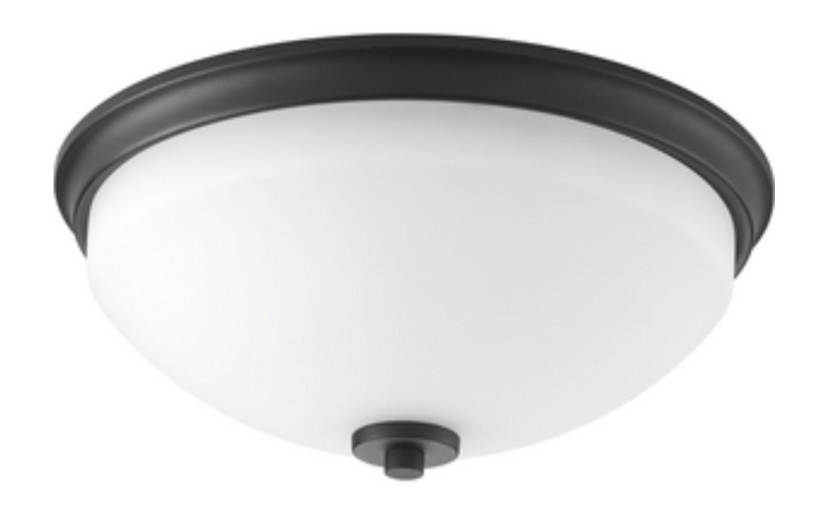
Guest Bedroom Lighting