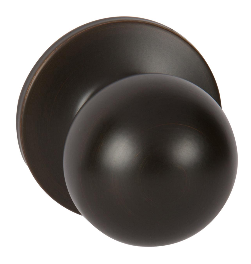
Interior Door Hardware