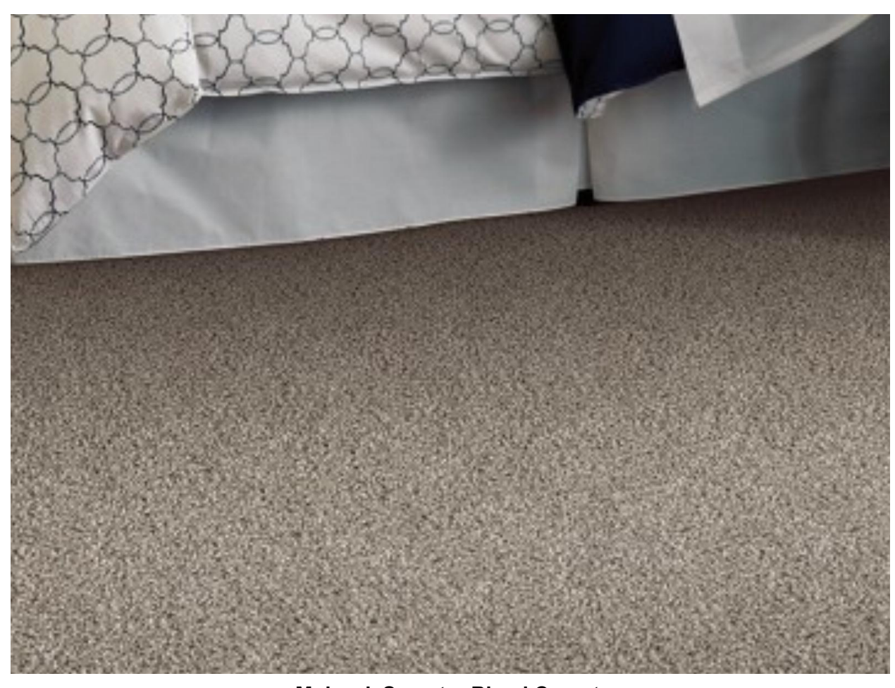
Mohawk Sumatra Blend Carpet