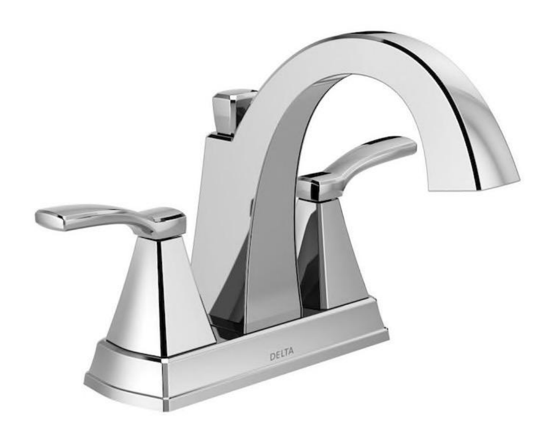
Delta Bath Faucet