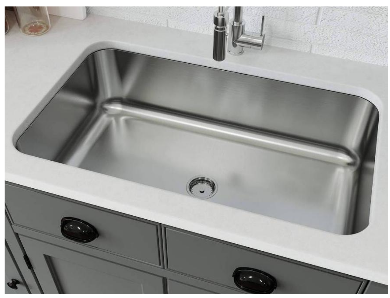
Stainless Steel Undermount Kitchen Sink