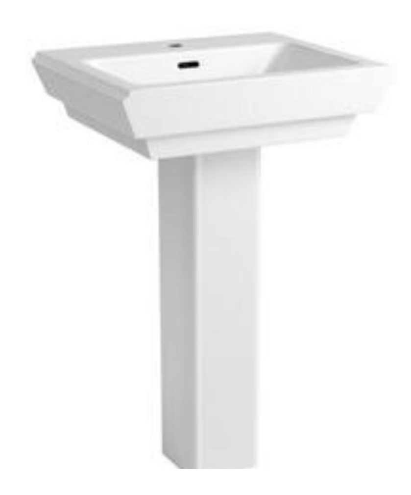
First Floor Powder Room Sink