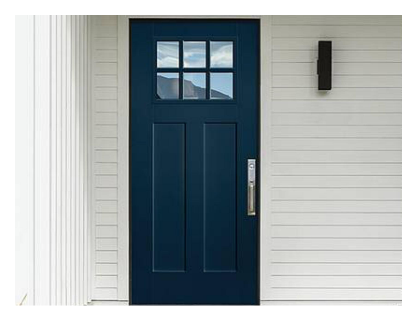
Front Door Style