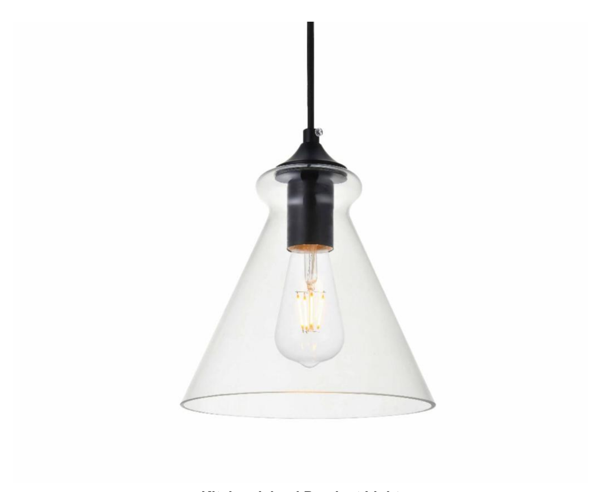
Kitchen Island Pendant Light