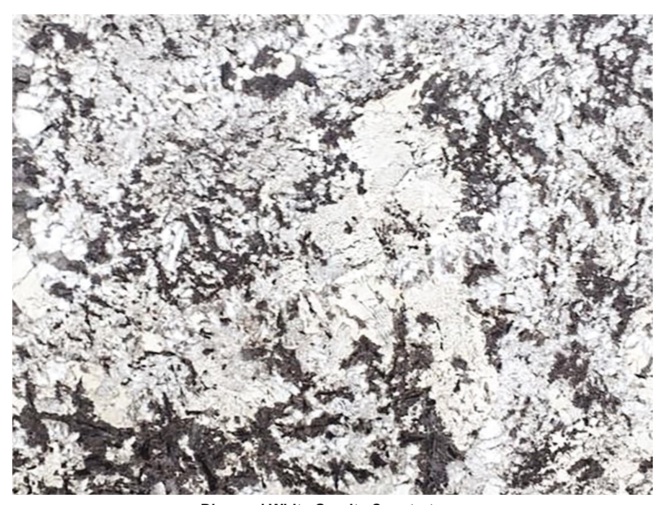
Diamond White Granite Countertops