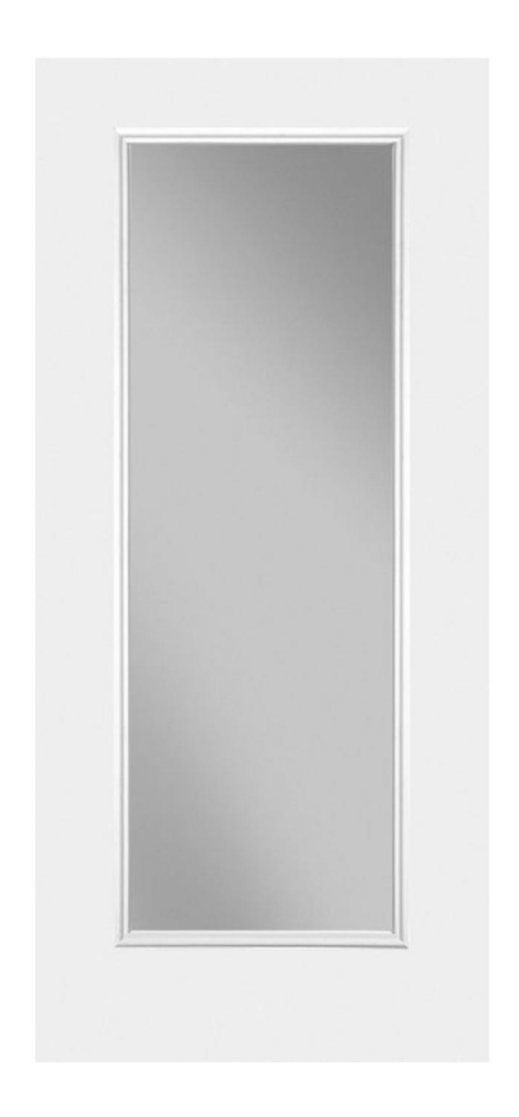
Rear Door Style