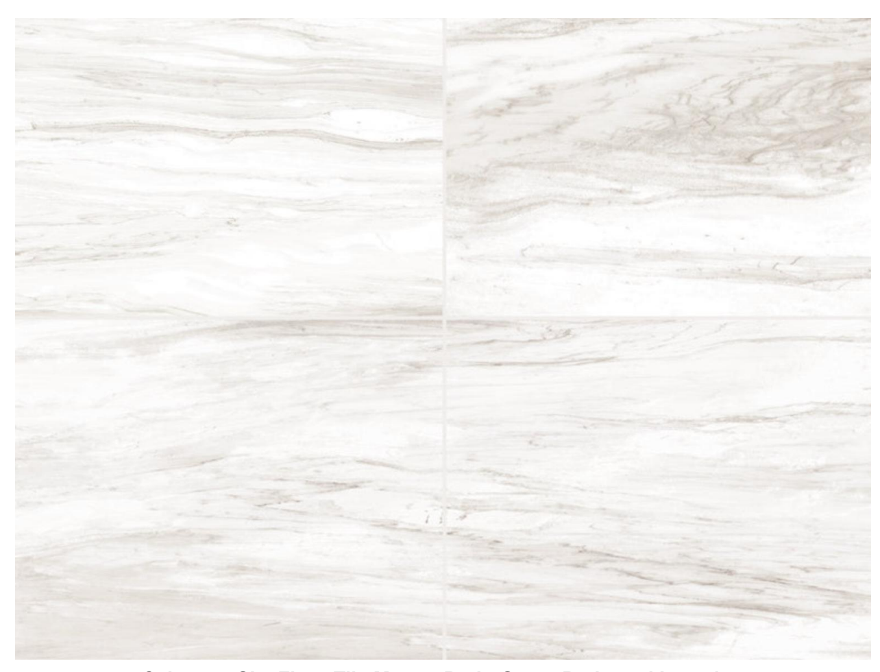
Calacatta Sky Floor Tile Master Bath, Guest Bath, and Laundry