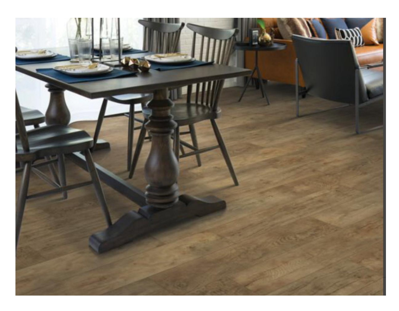
Mohawk Dorian Oak LVP Flooring Throughout 1st Floor