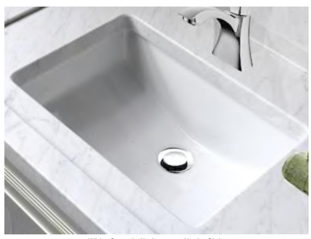
White Ceramic Undermount Vanity Sink