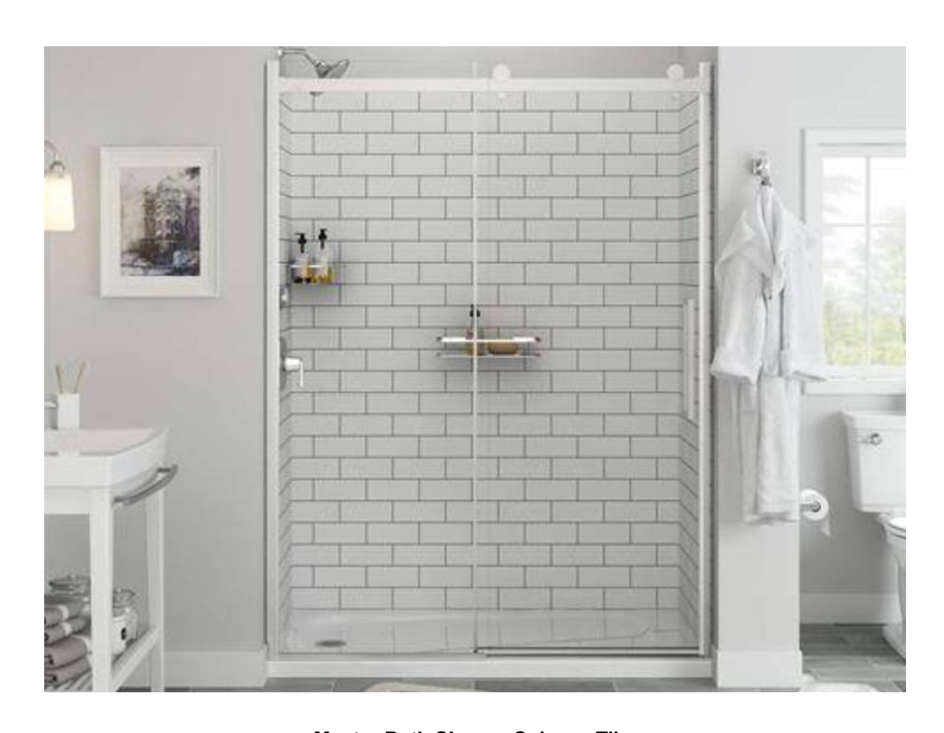
Master Bath Shower Subway Tile