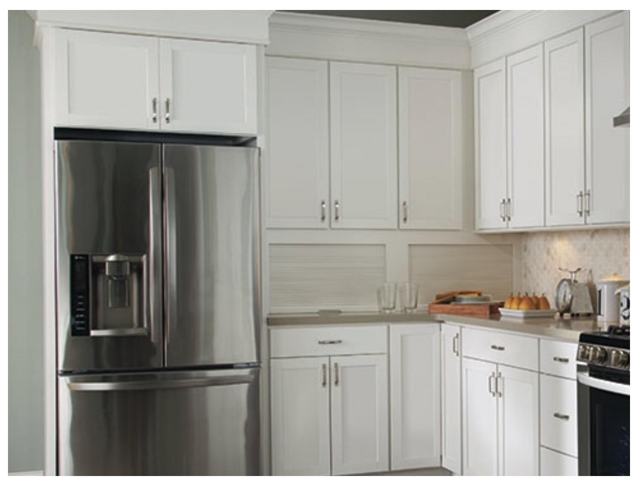
Aristocraft White Shaker Cabinets