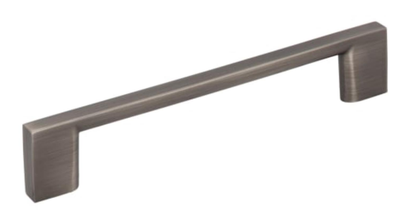
Brushed Pewter Cabinet Pulls