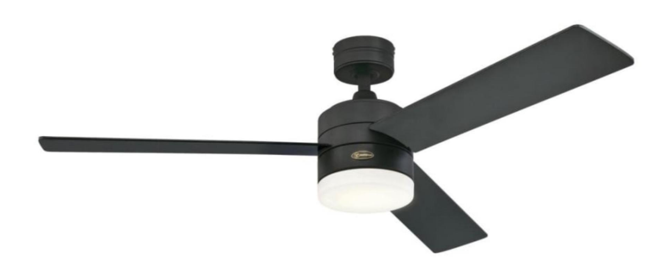
Master Bedroom and Living Room Ceiling Fans