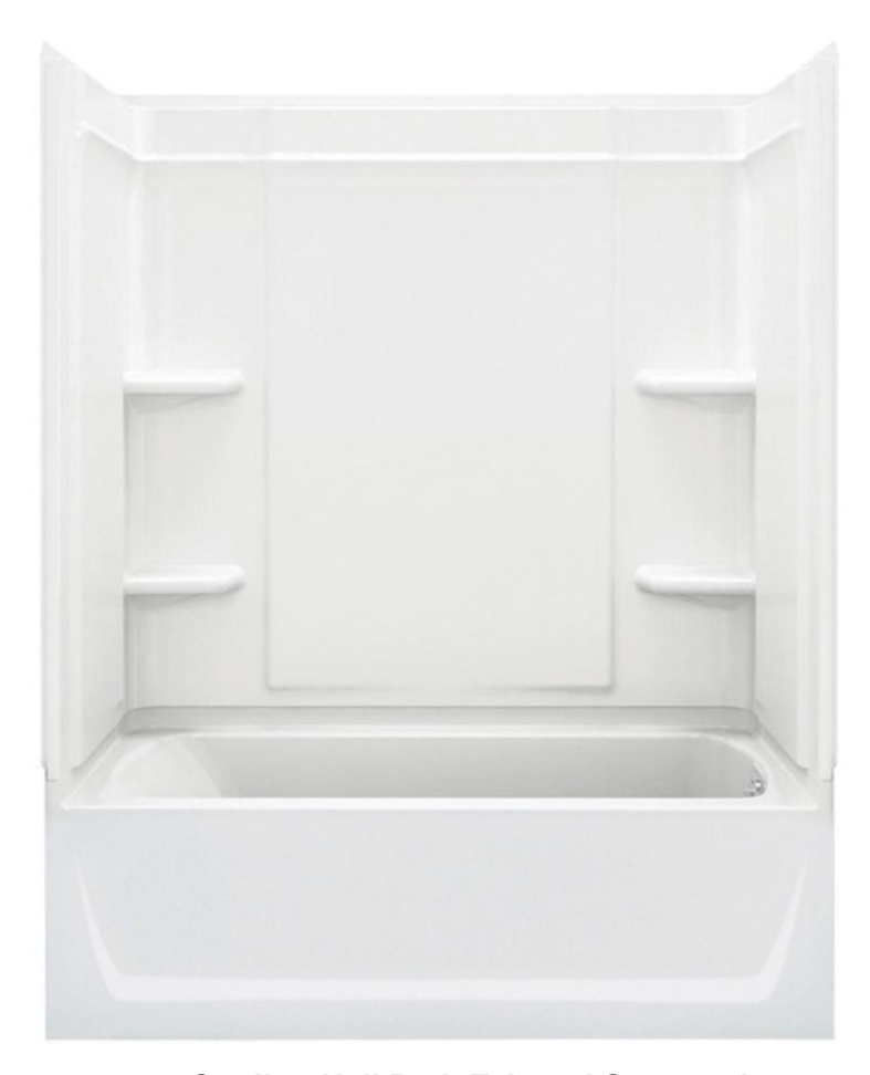
Sterling Hall Bath Tub and Surround