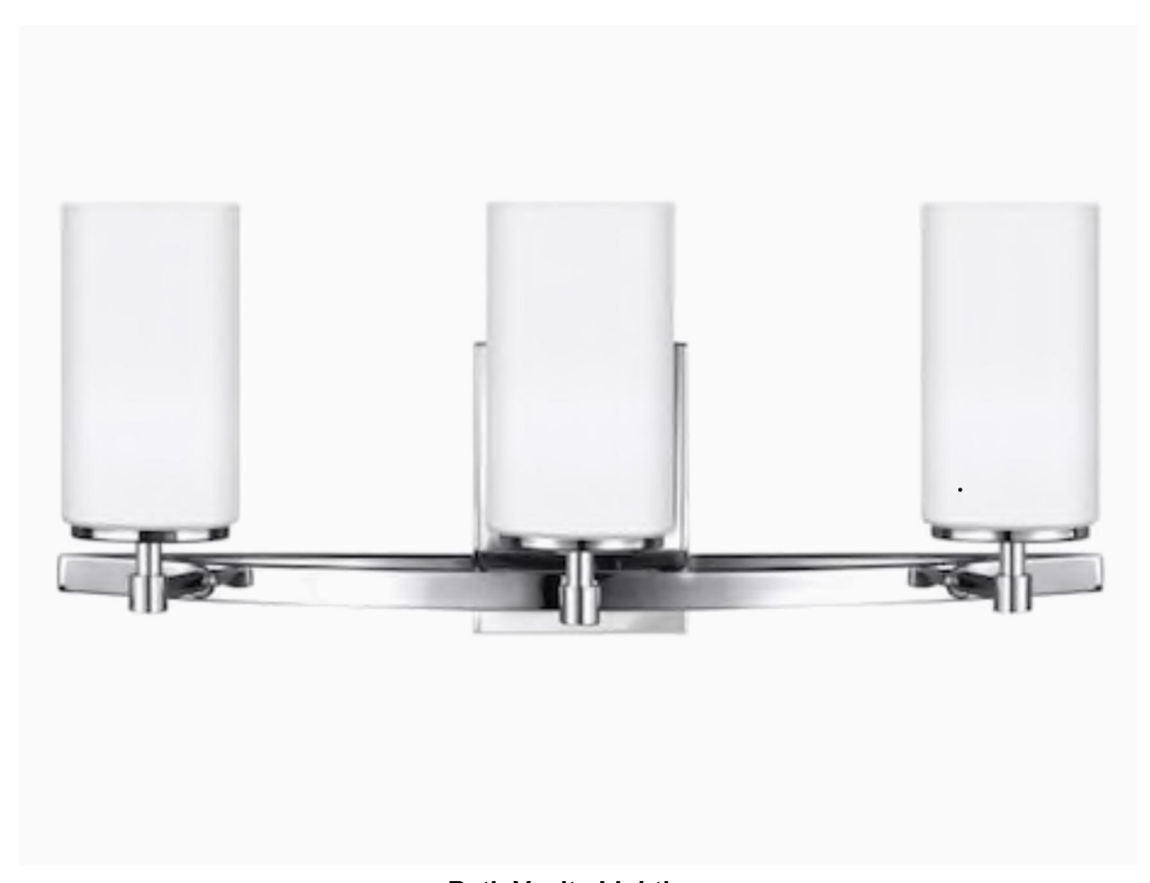
Bath Vanity Lighting