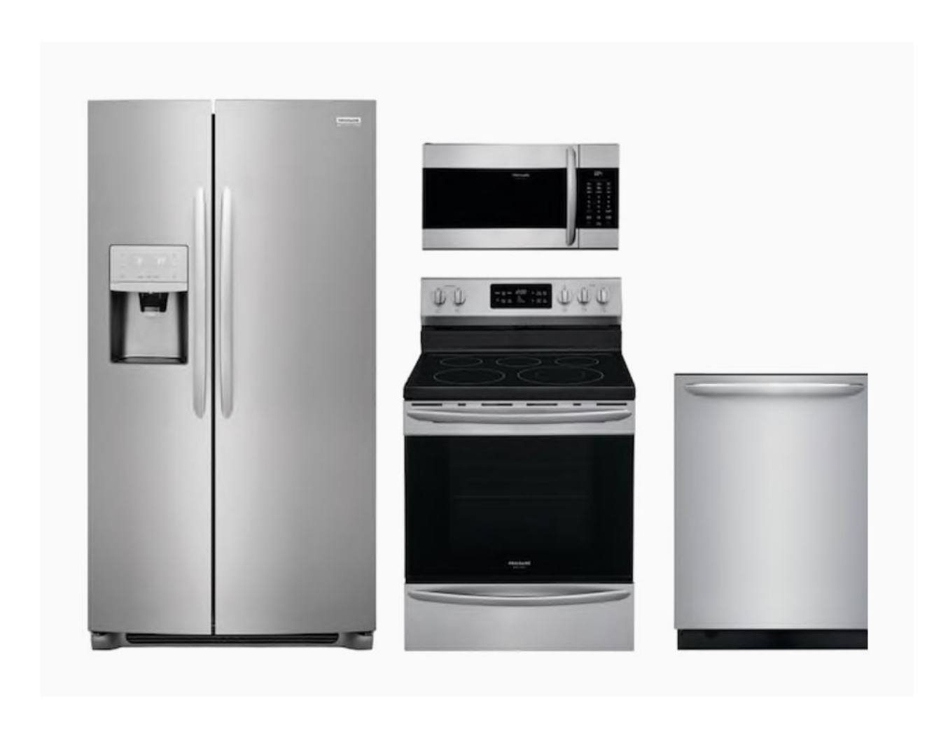
Frigidaire Stainless Steel Appliance Package