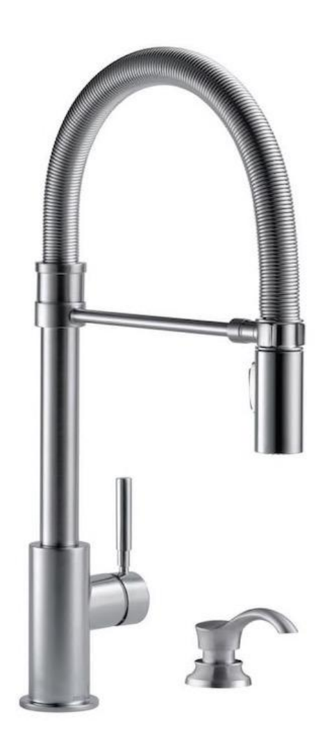
Delta Kitchen Faucet