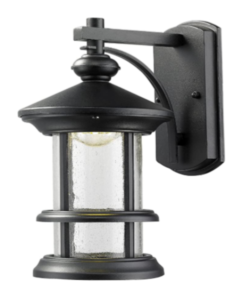
Exterior Wall Sconce